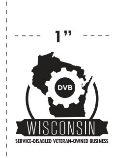
minimum size for logo placement

The minimum logo Size is 1 inch wide placed proportionally.