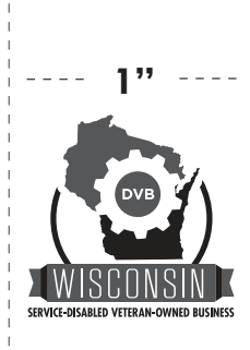
minimum size for logo placement