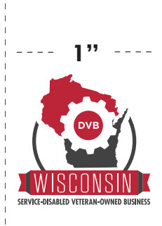
minimum size for logo placement